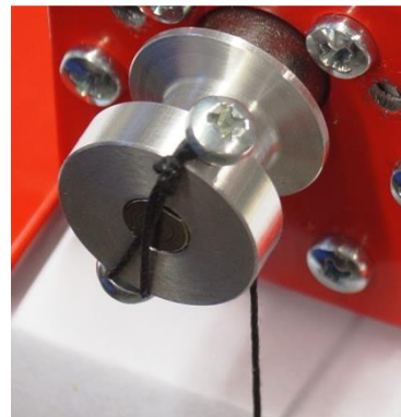
Fig. 1 Attachment of string