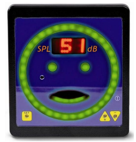
Fig. 1 Display with "happy smiling face"