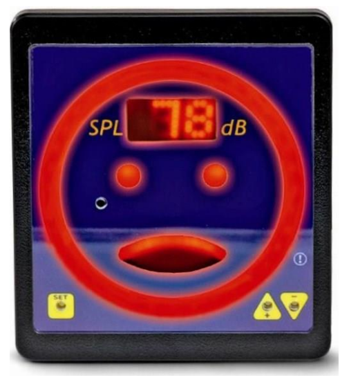
Fig. 2 Display with "frowning face"