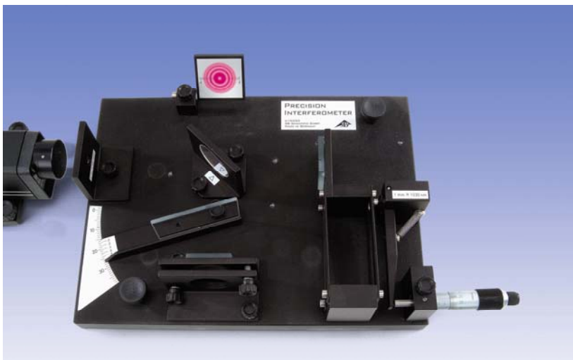
Fig.1: Experiment set-up for determining the refractive index of glass using a Michelson interferometer

By making a slight modification, the Michelson interferometer can be converted into a Twyman-Green interferometer, an instrument for measuring the surface quality of optical components. A Twyman-Green interferometer is normally understood to mean an instrument in which the (laser) light beam is expanded and formed into a parallel beam. However, for the qualitative understanding of the principle, a beam that is divergent rather than parallel can be used.